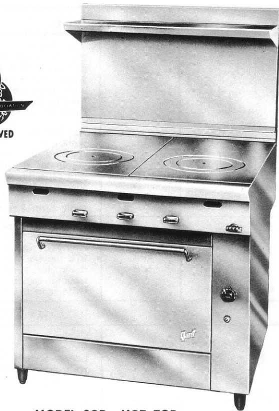
MODEL SGR HOT TOP

The ultimate in Heavy Duty Gas Range Design. Especially for the large hotel or institution where rigorous use and exceptionally heavy service demand a gas range of superior design. QUEST Senior Ranges have been used by leading Canadian operators for many years. Their built-in durability and high efficiency make them the leader in their field.