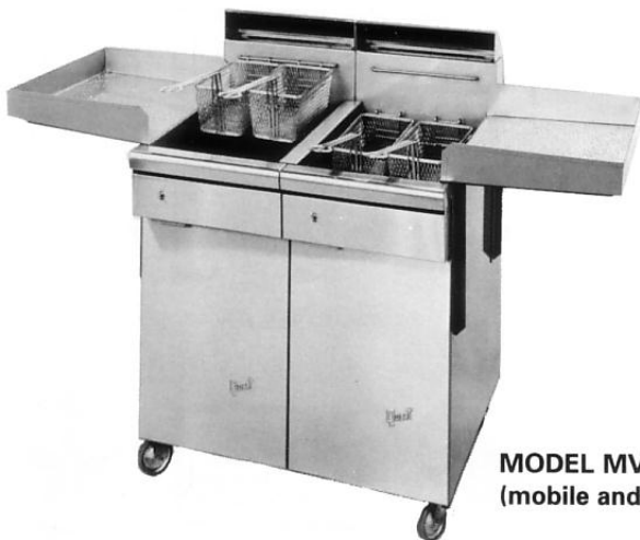
MODEL MV40 (mobile and c/w drain shelves)

Options available include mobility on casters, filter systems and drain shelves – all at minimal extra cost.